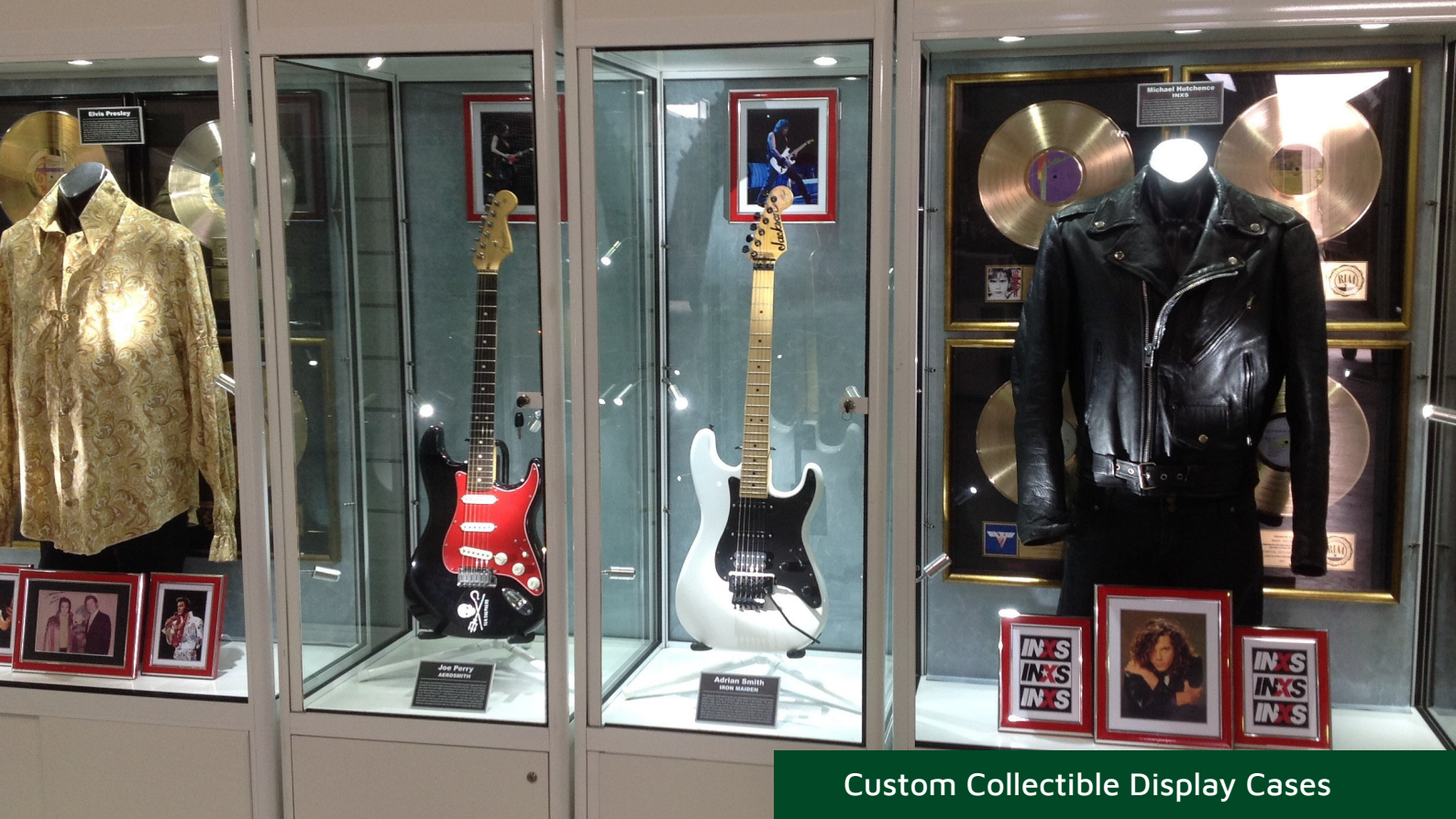
Custom Collectible Display Cases