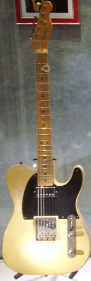
Keith Richards The Rolling Stones