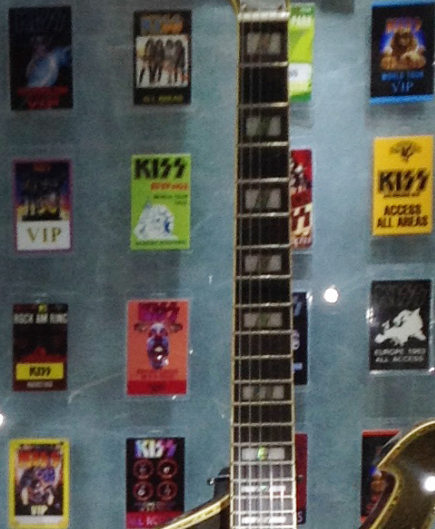
Paul Stanley KISS